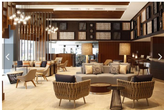
The lobby of the Hilton Garden Inn Waikiki Beach, which opened Monday.