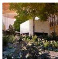
Costa Rica: Moving Beyond Eco-