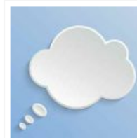
3 Things This Event Planner