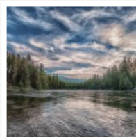
When a River Runs Through It