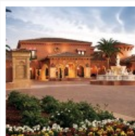
San Diego Resort Goes the Brand